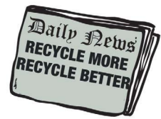
Plastic bag Mug+Plate Food scraps Drinking glass Newspaper