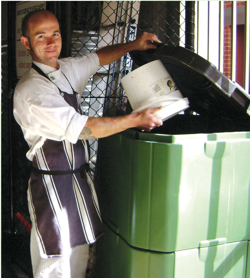
Composting vegetable scraps on-site reduces the amount of waste going to landfill